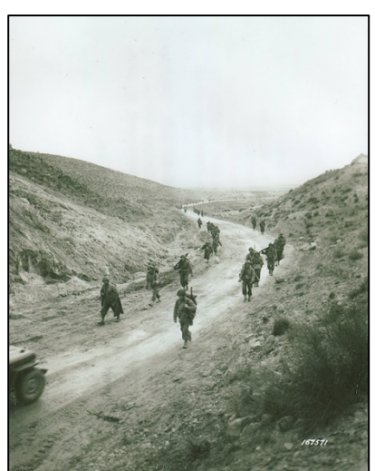
2/16th, 1st Infantry Division.

In just two days, 14 and 15 February 1943, II Corps lost 1,600 men, 100 tanks, 57 half-tracks, and 29 artillery pieces. General Fredendall, losing control of the battlefield, then pulled back toward Kasserine Pass, where his forces were again mauled days later. Following this debacle, three generals, including General Fredendall, were relieved.